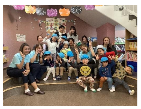
Miyanomori Maple Nursery School