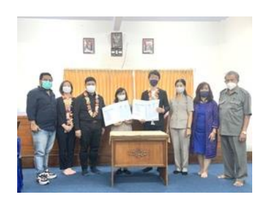
4. Bali Public School Kindergarten