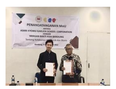
2. Bhakti Asi School