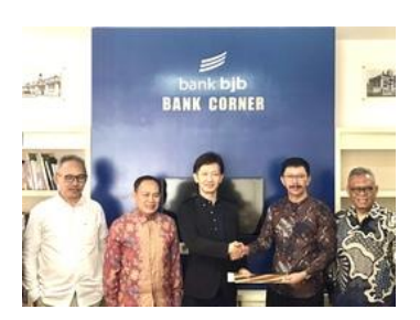
1. Sangha Buana University