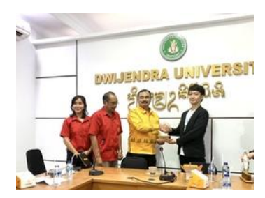
Dewi Jundela Kindergarten