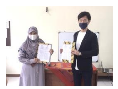
3. Darul Hikam Kindergarten